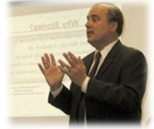
Coaching sessions every other week

Follow concrete steps to connect more effectively with others to build a strategic network